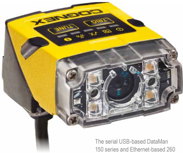
The serial USB-based DataMan 150 series and Ethernet-based 260 series models deliver unprecedented performance, flexibility, and ease-of-use.